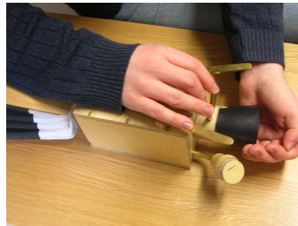
Figure 1: The 'speaking machine' (inner life): palm of the hand on the right forming vowel resonances in front of a rubber funnel ("vocal tract"); the hand on the wooden windchest ("thorax") regulating nasal cavity resonances; (invisible) elbow providing pressure on the bellows ("lungs"). The reed pipe ("glottis") is located within the "nose".

After many performances with the Saarbrücken replicas [2] for very different audiences – even if the speech was usually only 'Mama' and 'Papa' – we can report that nobody was left unimpressed. This is true for students as it is for professors, for children as well as for older persons, for those with a more technical background such as engineers as well as for those with a more human than technical interest such as speech pathologists. Even those trained in the phonetic sciences are unable to resist the fascination of the 'speaking machine'.