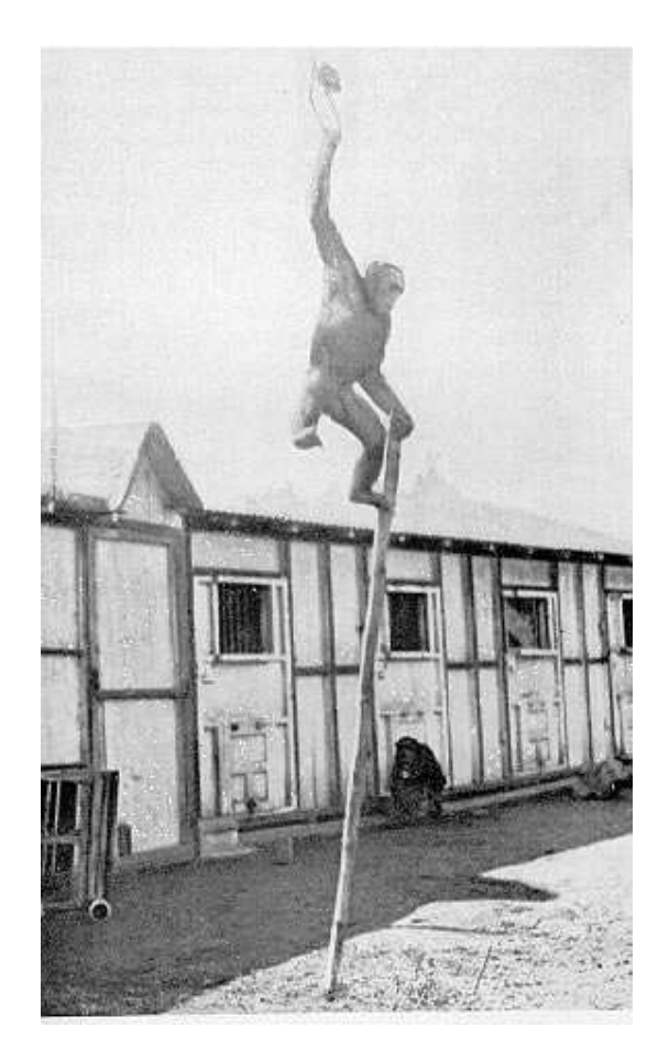
Figure 2: Köhler 1925