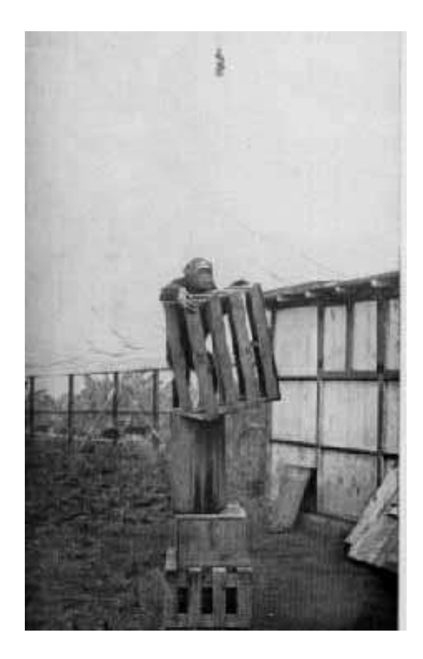
Figure 1: Köhler 1925