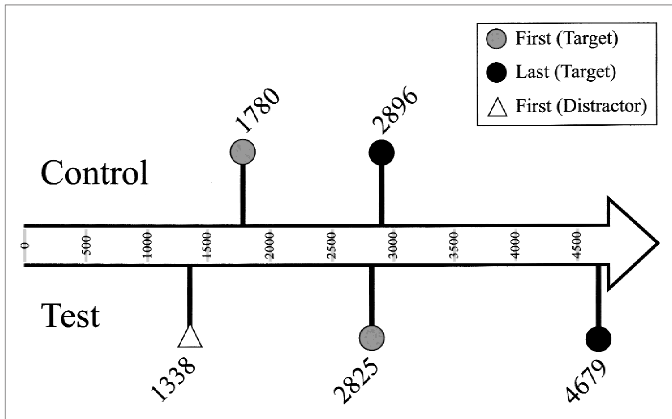
Fig. 3. Time line of eye fixations in Experiment 2, showing average latencies (in milliseconds) following the critical noun phrase (point 0).

the location of the occluded objects with each new trial. Also, we wanted to make sure that addressees knew which objects were not accessible to the director, so we instructed the addressees to help set up the arrays by hiding objects in the slots that were occluded from the director's perspective. With this procedure, it was absolutely clear to addressees which objects were shared and which were hidden. 2