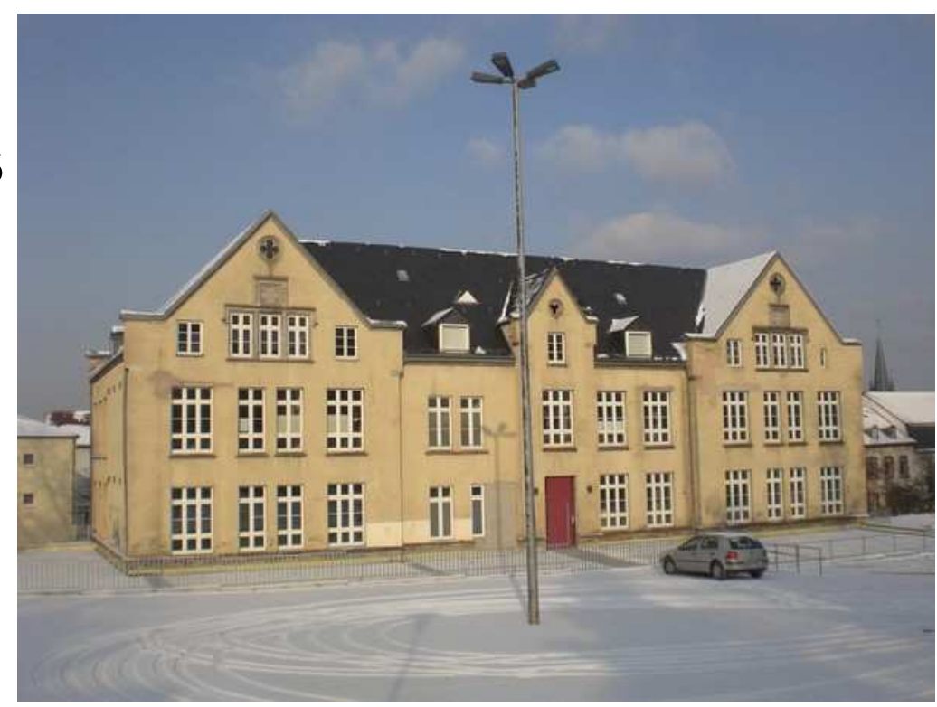
City archive Saarbrücken