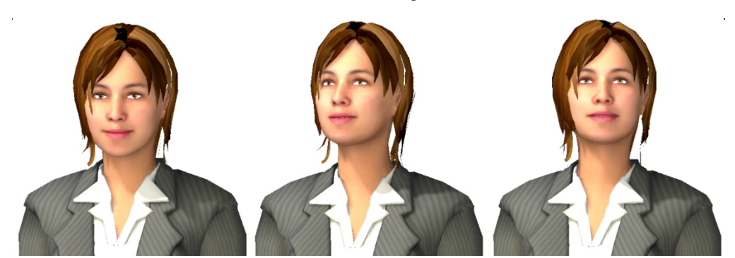
Figure 1: The three main postures of Embr in the AVERT condition. From left to right: Mutual gaze - Gaze to upper left - Averted gaze to the right towards turn end.

Bias is strongly negatively correlated with the duration of a turn (De Ruiter et al., 2006). Since SYNTH turns were considerably longer than the other versions (Table 1), we regressed bias on duration, and looked at the effect of our