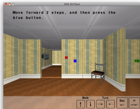
Figure 1: The GIVE Challenge.

GIVE (“Generating Instructions in Virtual Environments”) (Koller et al., 2007) is a research challenge for the NLG community designed to provide a new approach to NLG system evaluation. In the GIVE scenario, users try to solve a treasure hunt in a virtual 3D world that they have not seen before. The computer has a complete symbolic representation of the virtual environment. The challenge for the NLG system is to generate, in real time, natural-language instructions that will guide the users to the successful completion of their task (see Fig. 1). One crucial advantage of this generation task is that the NLG system and the user can be physically separated. This makes it possible to carry out a task-based evaluation over the Internet – an approach that has been shown to provide generous amounts