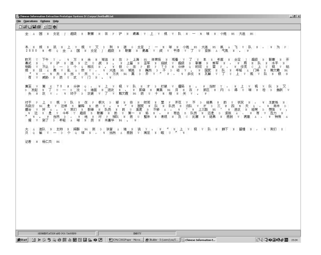
Fig 2. User interface for word segmentation and POS tagging

words, and the red alphabetical characters denote POS tags. In Figure 3, the black underlines and the red underlines represent the repaired part for Chinese character or word and POS tag separately. In Figure 4, it shows the error repairing number for word segmentation and POS tagging.