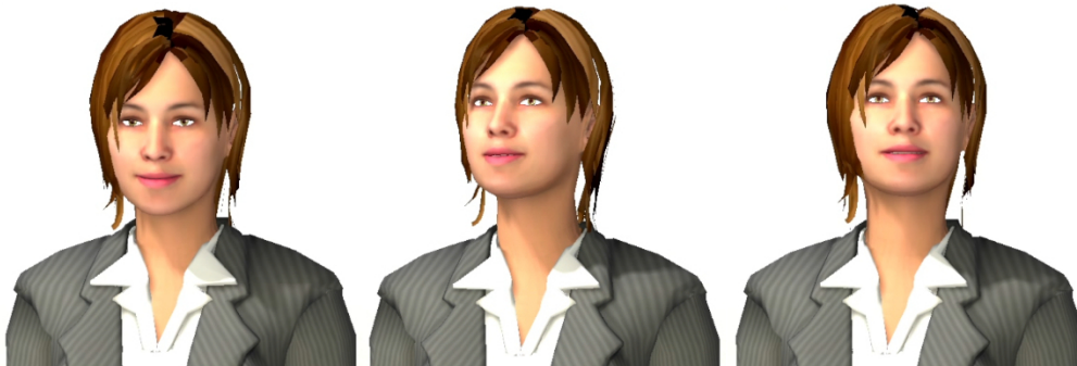
Figure 1: The three main postures of Embr in the AVERT condition. From left to right: Mutual gaze - Gaze to upper left - Averted gaze to the right towards turn end.

We created four lists using a Latin Square design, so that