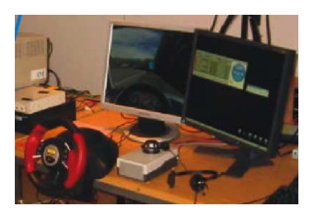
Figure 3. The current setup of the user environment.

The following aspects of the setup were designed to elicit interactions more realistically resembling dialogue with an actual system [6]: The wizard and the user did not directly hear each other, instead, their utterances were immediately transcribed; the wizard's utterances were then presented to the user via a speech synthesizer, and parts of the user's utterances were sometimes deleted to simulate acoustic understanding problems and elicit clarifications.